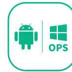
Android or Windows