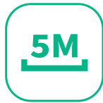
5m Pick-up Range